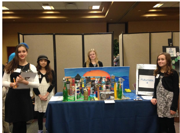
Team Futuristic Four Best Industrial/Commercial Layout