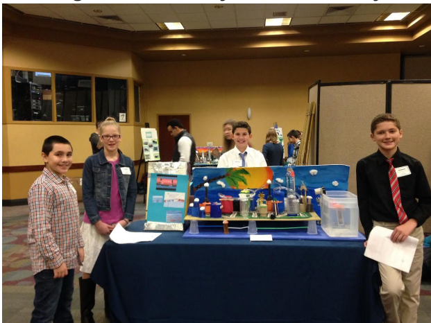
Team Futuristic Final Four Best Innovative Solution for a Small Community